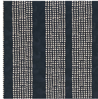
NAVY ON NATURAL